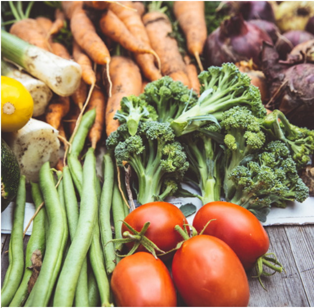
Nearly 2 tons of fresh produce was grown and donated to local food pantries from Extension and volunteer gardens.