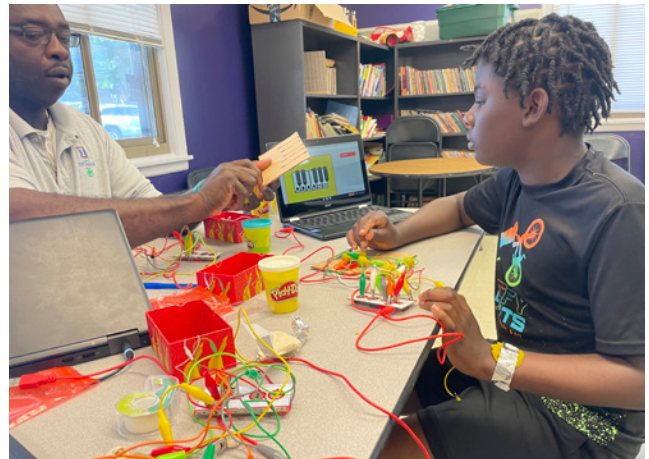
A Knox County youth puts his knowledge of coding and circuits to work using a Makey Makey board.

Extension mentors first year participants during field trips that introduce them to the variety of job opportunities available in Macomb. Recent highlights include tours of a local factory; visits with city, county, and state government officials; and presentations from young entrepreneurs while touring their businesses. Annually, 42 teen leaders from Macomb High School take part in MYLO.