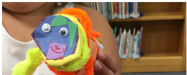
Youth displays the make-believe mammal she created.