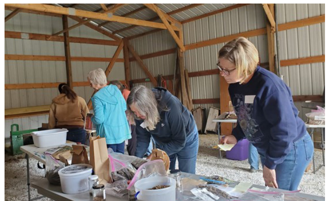
Participants at the Native Seed Share explore the numerous seeds available. Everyone received their top three species choices, as well as other quality seed.