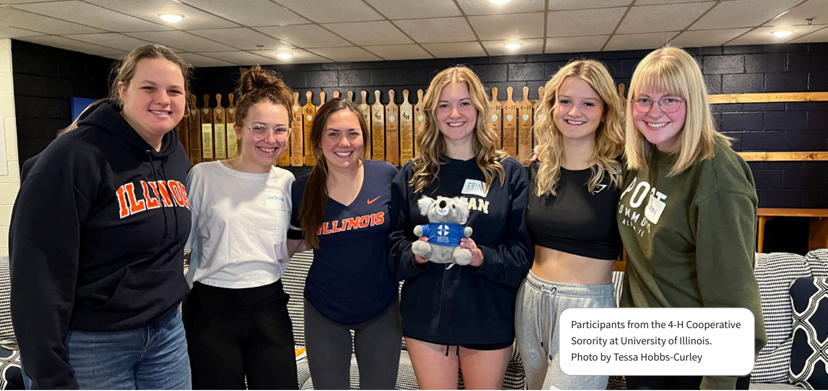
Participants from the 4-H Cooperative Sorority at University of Illinois.