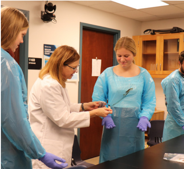
MYLO participants learn about health care professions and removing personal protective equipment with the Western Illinois University School of Nursing.

In the simulation, participants “live” for a month, paying bills and facing many choices for how they spend available money. They learned how career choices and monthly spending habits impact their ability to spend and save. Welcome to the Real World develops youth self-sufficiency which contributes to the overall health of the community.