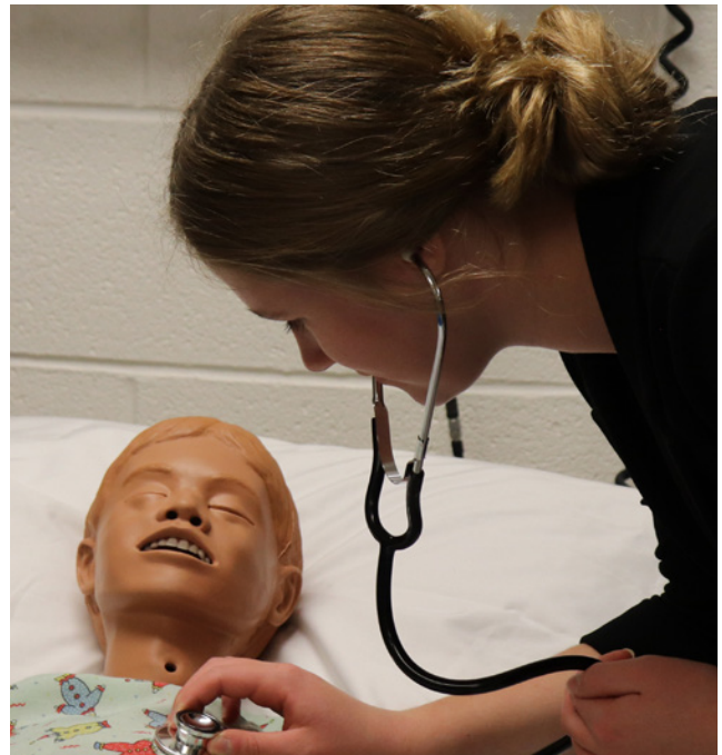
Using simulation tools, MYLO participants learned what sounds a health care professional will listen for in patients.